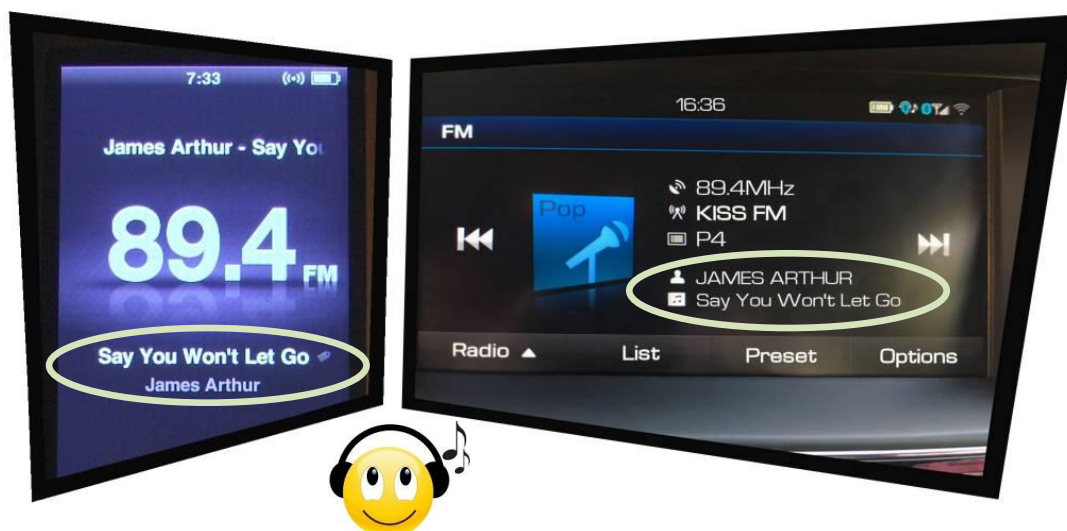
Figure 2 – Final result – RDS encoder with X-Command support

XCMD=<rds><item><dest>3</dest><text><artist>James Arthur</artist> - <title>Say You Won't Let Go</title></text></item></rds>