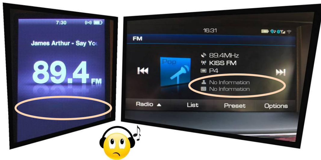
Figure 1 – Final result – standard RDS encoder

TEXT=James Arthur - Say You Won't Let Go